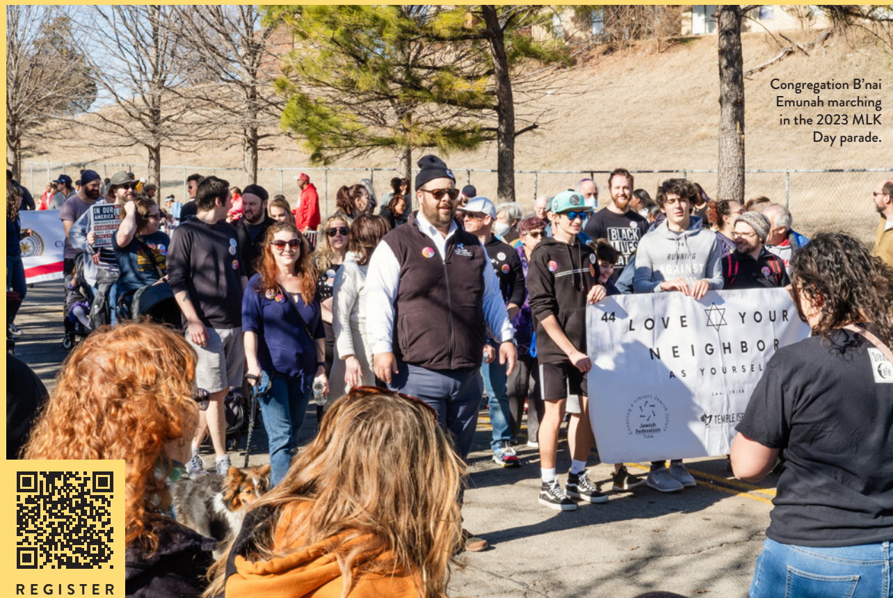
Congregation B'nai Emunah marching in the 2023 MLK Day parade.