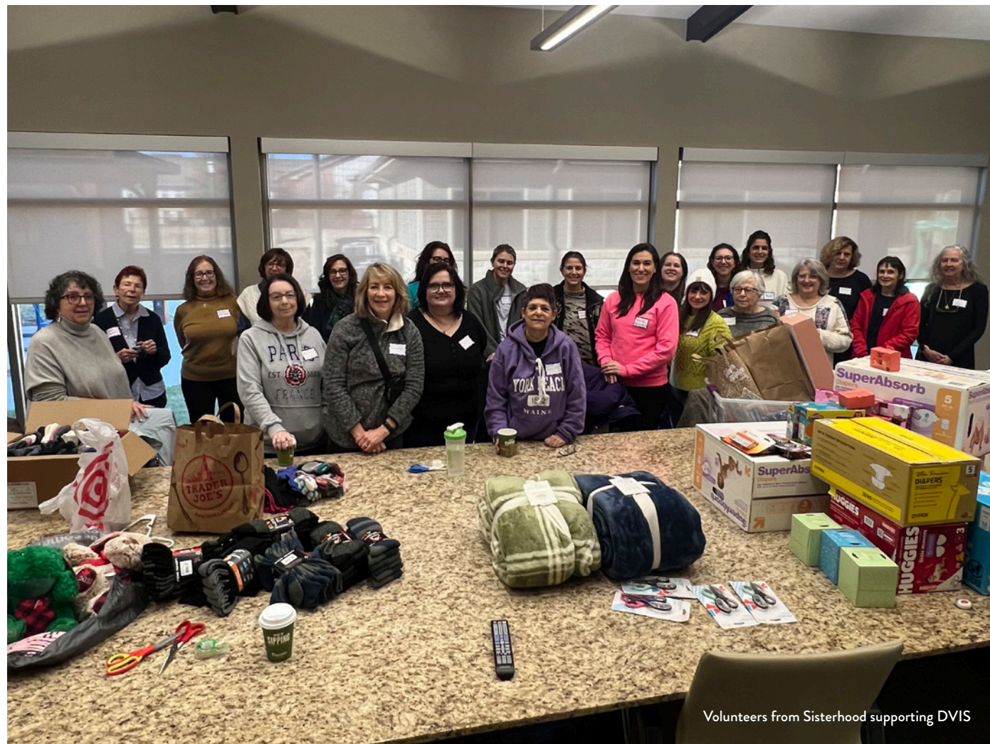
Volunteers from Sisterhood supporting DVIS